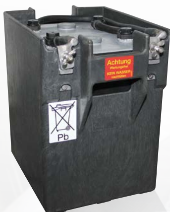
|| PzV / GiV maintenance-free, sealed