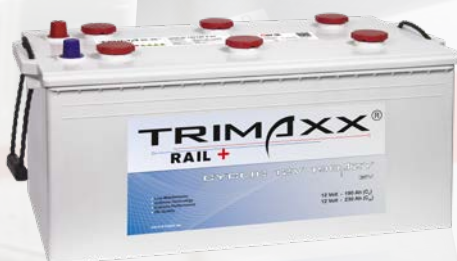
|| Block battery wet