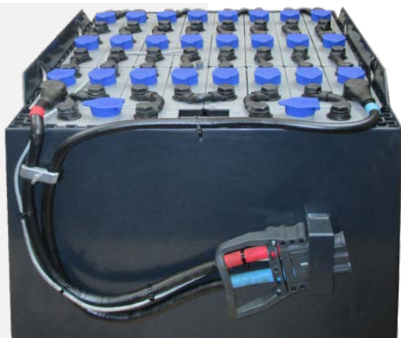
|| PzS low maintenance, closed

Solid energy suppliers in proven technology