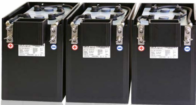
■ Bombardier DOSTO 2010

Reduced maintenance intervals of up to one year by using cells with increased electrolyte level.