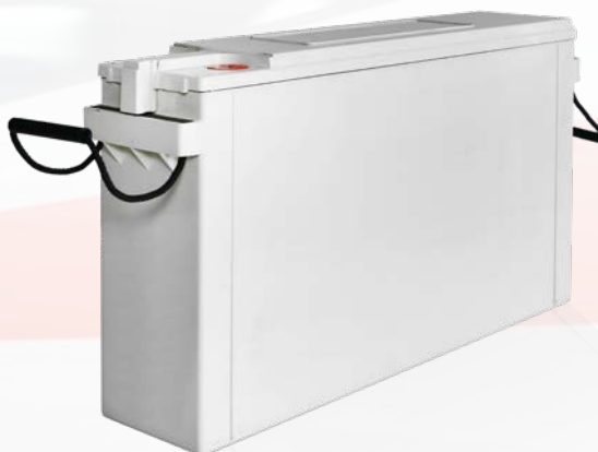
|| Block battery pure lead