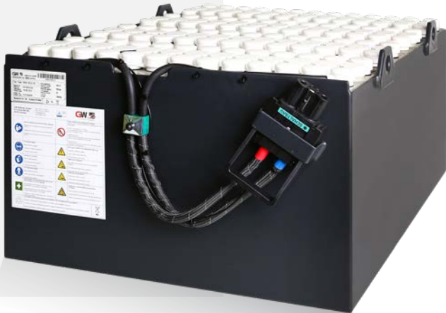
■ Bombardier Traxx AC 3