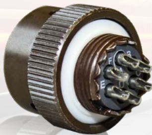
▮ Special connector